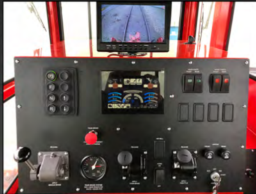
180 degree rotating console with multifunction display. Dual four-way air suspension seats for operation from either side of cab when in rail mode.