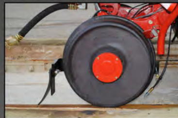
Powerful air knife increases capacities up to 50% in adverse weather.