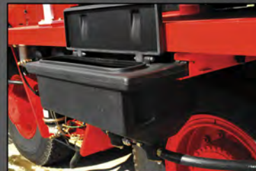
Pull out sander boxes with wide mouth lids for easy loading. Air activated sanders for smooth dispensing.