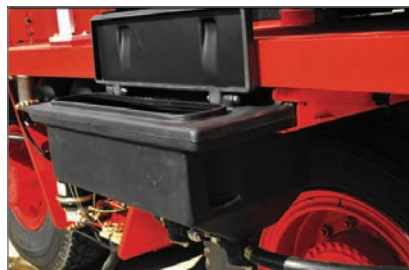
Pull out sander boxes with wide mouth lids for easy loading. Air activated sanders for smooth dispensing.