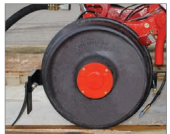
Powerful air knife increases capacities up to 50% in adverse weather.