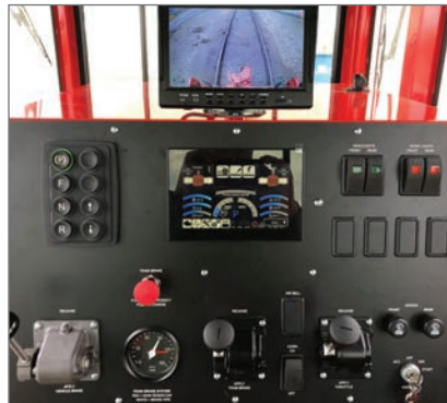
180-degree rotating console with a multifunction display. Dual four-way air suspension seats for operation from either side of cab when in rail mode.